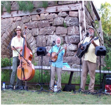
Blue Water Ramblers